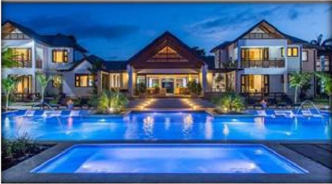
OWN LUXURIOUS HOME