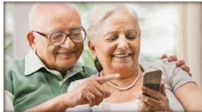
OLD AGE SECURITY